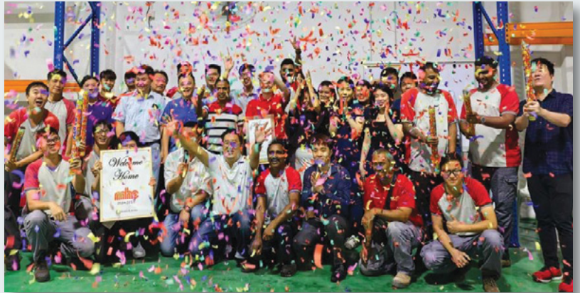
Welcome celebration for new MHE colleagues at their newly renovated office in Singapore.

To this end, the Group's latest acquisition of Electro-Mechanical Services (EMS) Australia will fortify our Australian presence and enable MHE to bring more industry-leading innovations, including a brand-new Automated Guided Vehicle (AGV) parking solution, to customers across all our active markets.