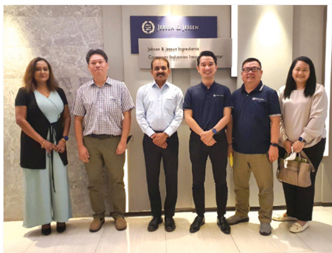
The Feed team in Thailand warmly welcomes EW Nutrition to a technical sales training, strengthening our team's expertise in the market.

With EW Nutrition's science-backed functional innovations and Jebsen & Jessen Ingredients' strong regional expertise, the partnership is expected to bring comprehensive and effective animal nutrition solutions to the livestock market and contribute to sustainable growth through reduced FCR, natural support against challenges, reduced need for antibiotics, and planet-friendly protein production.