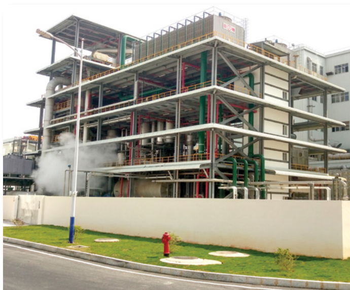
A COFCO Group processing plant, Dongguan City, China.

To date, the COFCO Group has adopted three units of the upgraded system. Since upgrading, they have significantly reduced their carbon and non-methane total hydrocarbon emissions. JJ-Lurgi is pleased to offer customers a more eco-friendly and fuel-saving solution, enabling them to save on producing up to 100 tonnes of steam per day.