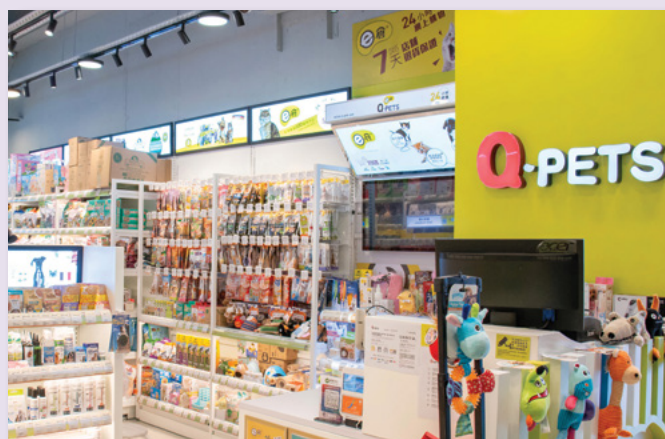
A Q-Pets retail store in Hong Kong.

Jebsen Group made clear its intention to maintaining Q-Pets' position as the top choice for pet care customers and is committed to contributing to the growth and development of the pet care sector: